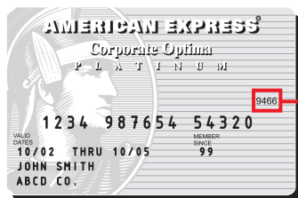
4 Digit Card Verification Number